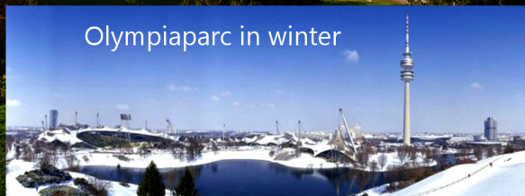
Olympiaparc in winter